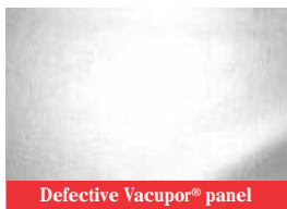
Defective Vacupor® panel

Please contact us if you require assistance.